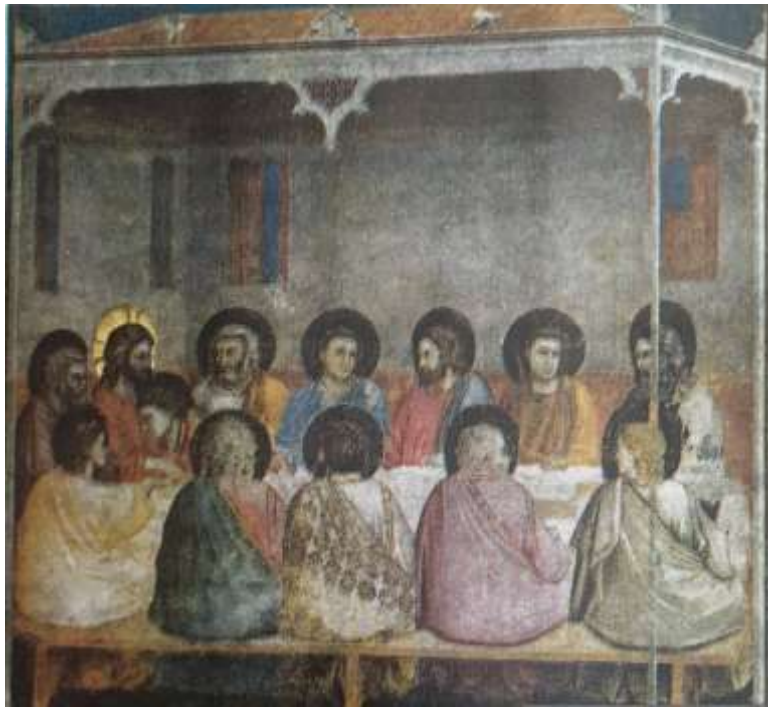
Fig. 3. The Last Supper by Juto (1236-1337 AD), one of the 25 narrative scenes with the fresco technique entitled The Passion of the Christ Prayer House (Church) Arena, 1305 AD

In the second stage, iconography (painting): the place of research and narration and literary support of the work: taken from the text of the Gospel of Matthew, chapter twenty-six (as mentioned in the second stage of Da Vinci's iconographic analysis. One of the 40 main frescoes in The Arnaviki Church is one of 25 narrative scenes entitled The Passion of the Christ.