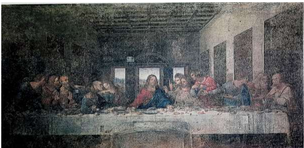
Fig. 2. The Last Supper by Leonardo da Vinci, Tempera and Oil Painting on the Wall, Milan, 1495-7 AD, 9/09 .

Combining the horizontal line of the dinner table and the arrangement of columns such as vertical on the walls with the window, placement and four groups of three people on either side of the picture, as well as how small objects are placed on the table, how to stand and move people from one panel to another, it has prevented the image from a dry and lifeless picture. And excellent examples of equilibrium of equal sizes can be seen in this table (Rankinpour, 2001). Technique: The foggy state of the work space is reminiscent of the Esfomato technique, which is specific to the paintings of Da Vinci (155-1452 AD), which was painted in the form of a mural (fresco) during the years (1495-98 AD) (Figure 2).