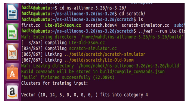
Figure 2. Run the program in the NS-3 environment